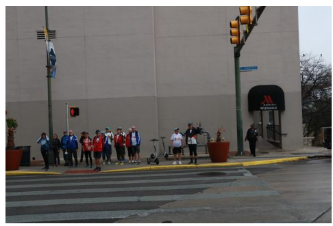
Walkers on the trail along East Commerce Street.