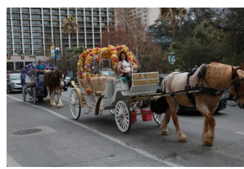
The walk route along East Commerce Street to LaQuinta Hotel Finish.