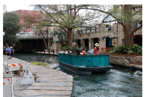
The walk route along San Antonio Riverwalk.