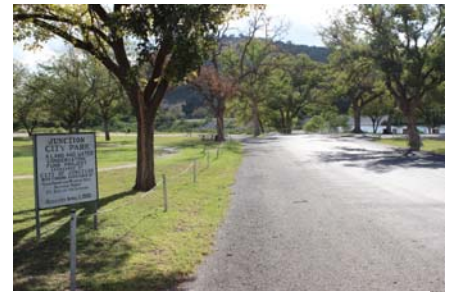
The trail along the Junction walk 9/6/14