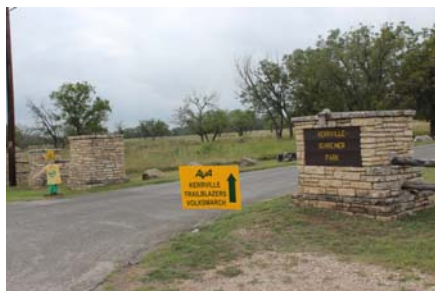
Kerrville Schreiner Park walk 9/20/14