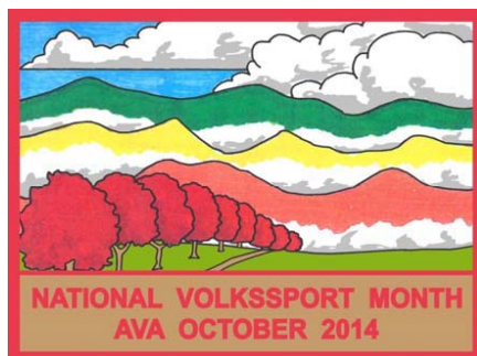
Patch design courtesy of Dorm Batson Northwest Region

fill a yellow book for 3,000 to reach 25,000 and continue in the yellow book for 5,000 after that. You now have the option of continuing to use the orange book after reaching 22,000 kilometers. As you finish each new 1,000 kilometers over 22,000, you will receive a certificate. You will receive the normal pins, patches and certificates for 22,000, 25,000 and increments of 5,000 over 25,000. Please make sure each orange book you send in has the total kilometers at the top that you have reached so Karen may log in the correct level you have obtained. This change is effective immediately.