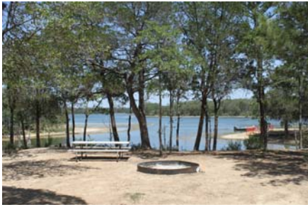
South Shore Park - Lake Bastrop walk.

RANDOLPH ROADRUNNERS PO Box 2744 Universal City TX 78148-174