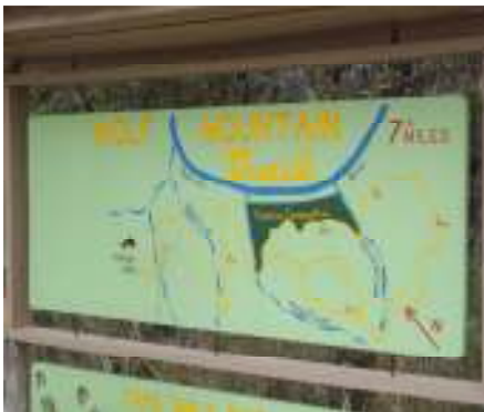
Pedernales Falls Wolf Mt. Trail walk March 1 & 2

American Volkssport Association 1001 Pat Booker Road, Suite 101 Universal City, TX 78148