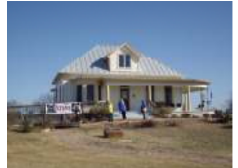
Start Point – Mitchell Lake walk – March 8 & 9