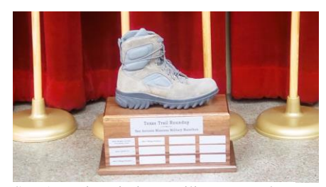
San Antonio Missions Military Marathon award boot. The Viking Strollers have won the award for three years in a row.

The closing ceremony was from 1:15-2:15 pm. After that, all the volunteers in the hall helped put away the flags, flag stands, and other items needed to run the event.