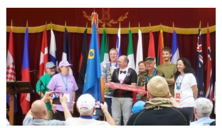
The Viking Strollers accept their San Antonio Missions Military Marathon award boot and streamer for their club's flag

Sunday morning, I was scheduled to work the finish table from 9:15 am to 1 pm. Early on, it was very slow as the walkers returned at their own pace. But from noon to 1 pm, it got very busy.