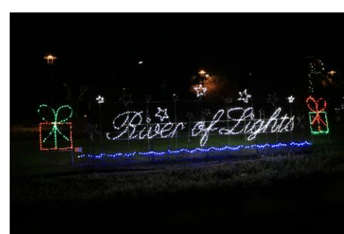
The "River of Lights" display visible across the river from along the River Walk Trail.