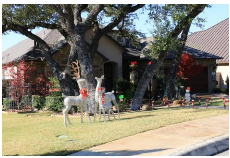
A home along the trail through Woodside Village decorated with reindeer, snowmen and other Christmas figures.