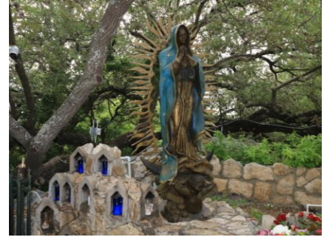
The sculpture of the Lady of Guadalupe along the walk trail through the Guadalupe Tepeyec Shrine located atop of the Lourdes Grotto of the Southwest at Oblate Mission.