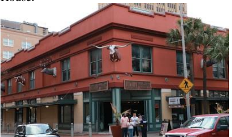
The Buckhorn Saloon and Museum and Texas Ranger Museum along the walk route