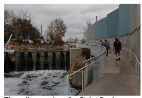
The walk route along San Pedro Creek.