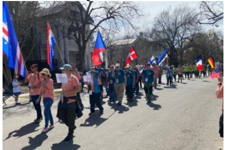
Volkssporters marching in the parade with the flags of the member nations of the IVV in alphabetical order.