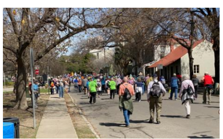
The end of the parade of Volkssporters leaving the start point.