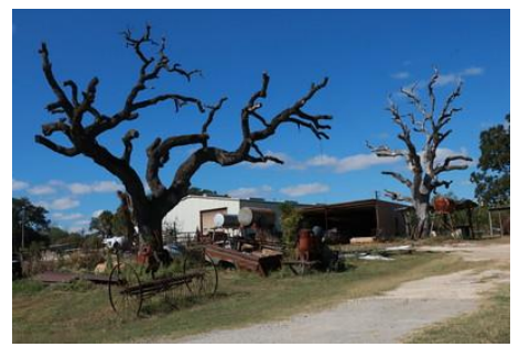
Spooky trees along the trail on Ave. C