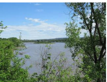
Another view of the Yellowstone River

We walked back to the truck and ate lunch at The Tippy Cow Cafe. This restaurant had a comfortable interior and great service. We each had enough food for two to three people on our plates. Recommendation if you eat here: share a menu item!