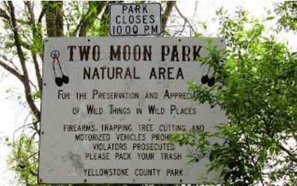
Most of our 5km was in Two Moon Park. We hiked around the trails there and hiked down to the Yellowstone River.