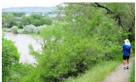
This walk followed the Jim Dutcher Trail (paved) to Two Moon Park along the Yellowstone River.

On Saturday, June 11 , we decided to walk the 5 km Dutcher Trail North Volksmarch. We would also have done the south 5 km Dutcher Trail but it was closed due to highway construction. We parked in the Upper Level Parking next to MetraPark arena to start.