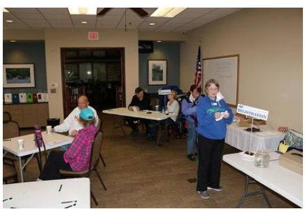
At the walk Start Point, workers and walkers.