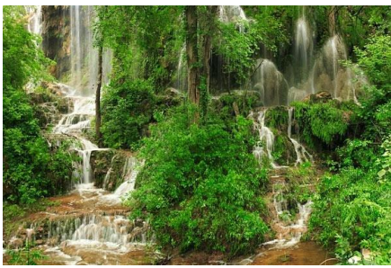
Gorman Falls, Colorado Bend State Park West Texas Trail Walkers Featuring Colorado Bend State Park Event October 7-9, 2022

Mark your calendars for February 19-26, 2023. San Antonio is the place to be!