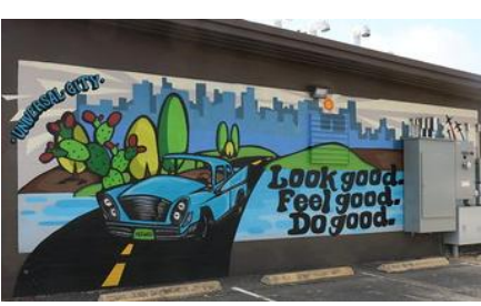
UC Mural along the walk route.