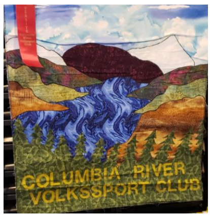
Tales from the Trails – Columbia River Volkssport Association walking weekend in Bend, Oregon. - Friday, September 17, 2021

www.facebook.com/2023IVVOlympiad USA and "like" us! Invite your volkssporting friends and fellow club members to like us. Help us build awareness and excitement as we move towards 2023! Look for the latest on the joint Olympiad/IML events and answers to questions you may have.