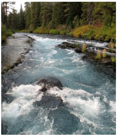
Wizard Falls on the Metolius River

Our walk was so easy compared to Misery Ridge at Smith Rocks State Park. There were minimal elevation gains along the Metolius River. At times, we had to veer away from the river due to private property. Overall, it was a very nice walk. We walked up one side of the Metolius River, crossed a bridge, and walked down the other side.