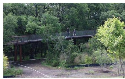
A view of the Skywalk from the trail to the finish.